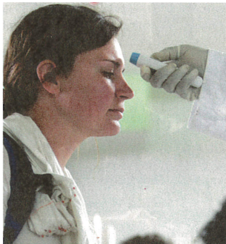
Hot and bothered

The World Health Organization recommends that passengers on international flights out of Sierra Leone, Guinea, and Liberia should be screened for evidence of Ebola before boarding their flight. Those with symptoms or a raised temperature should not be allowed on the flight. Clearly, identifying people with Ebola before they board an international flight is a desirable objective. But how well does this system work in practice? Data are not available on the number of passengers denied entry to